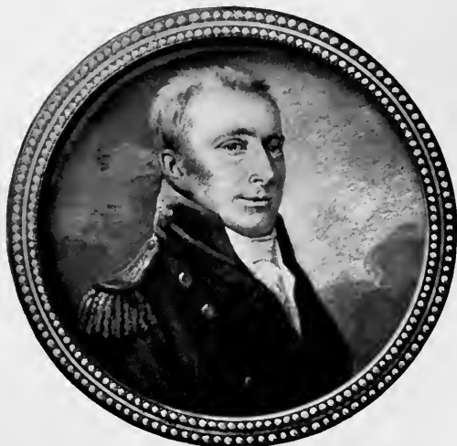
Colonel Tobias Lear Page 131